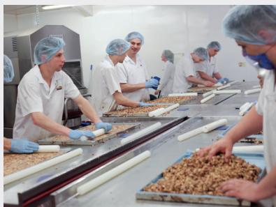
Wholebake, Bridges Sustainable Growth Fund III

Bridges UK and US Sustainable Growth Funds provide mission-aligned capital for high-growth businesses that are creating impact through what they do, how they do it or where they're located. Through these funds, we have been able to prove to a range of investors that impact really can be an engine of value.