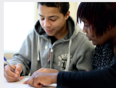
Community Links, Bridges Social Impact Bond Fund

These funds provide financial and operational support to social sector organisations delivering services with high societal impact. The Social Entrepreneurs Fund helps fast-growing enterprises to scale, while the Social Impact Bond Fund, the first of its type in the world, provides up-front capital and support for those delivering outcomes-based contracts.