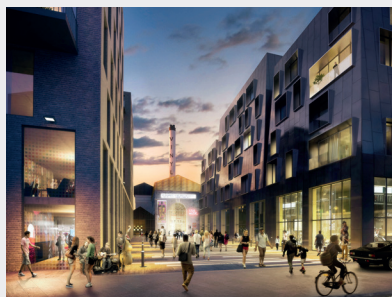
The Old Vinyl Factory, Bridges Property Alternatives Fund III

Our property funds seek out investment opportunities where creating social or environmental value – by unlocking the potential of emerging locations, or improving the energy footprints of buildings, or building high-quality care homes for the elderly, for example – also allows us to unlock significant financial value for investors.